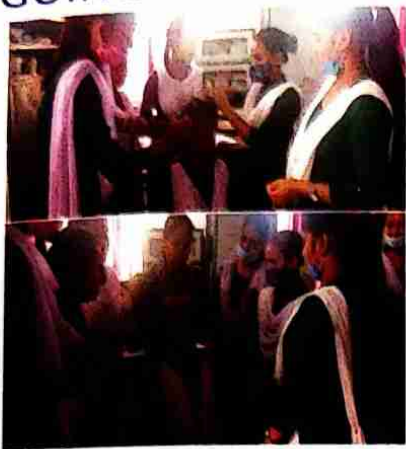
Six Month Diploma Certificate Course on Beautician