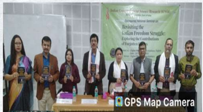
A National seminar entitled "Revisiting the Indian Struggle: Exploring the contributions of forgotten Heroes" sponsored by Indian Council for Social Science and Research, New Delhi( ICSSR) was organized on 15th March,