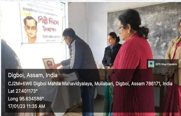
Digboi, Assam, India CJ2M+6W6 Digboi Mahila Mahavidyalaya, Muliabari, Digboi, Assam 786171, India Lat 27.401173° Long 95.634588° 17/01/23 11:35 AM