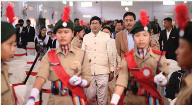
Hon'ble Vice Chancellor of Dibrugarh University at our College on 1st Feb, 2023.