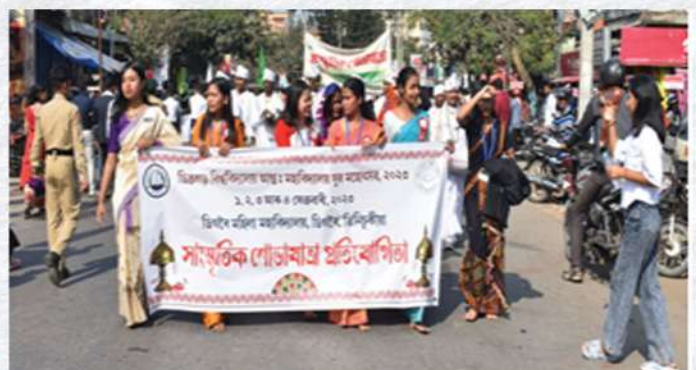
Cultural Procession on 4th February, 2023